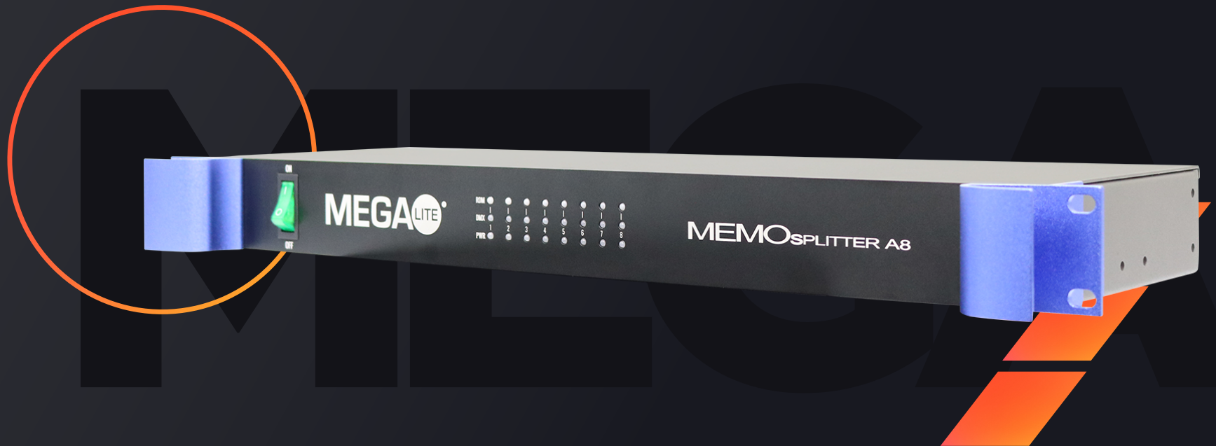
MEMO SPLITTER A8